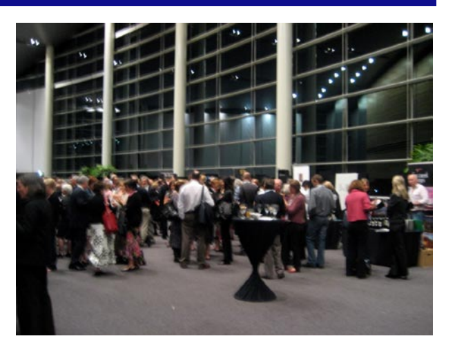
ASCIA 2009 Welcome Function Adelaide Convention Centre 15 September 2009