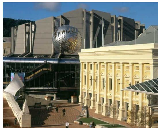
Wellington Town Hall (pictured to the right of Civic Square) is the main ASCIA 2012 venue