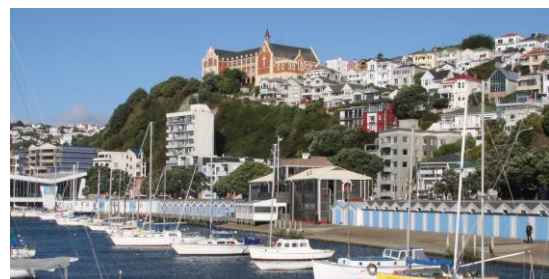
Oriental Bay, Wellington, New Zealand

I look forward to seeing you at ASCIA 2012 www.ascia2012.com in Wellington New Zealand, from 5 th to 8 th September. ■