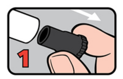
PULL OFF BLACK NEEDLE SHIELD